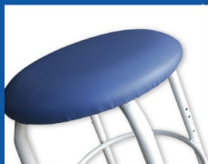
ADJUSTABLE LEGS HEIGHTS: 49cm to 66cm

The adjustable leg version allows an assortment of heights to accommodate everyone, and can be tilted to relieve the strain on your lower back. The tilt feature also puts you over your work. The stool is done attractively with a white frame and blue seat. The adjustable leg model not only serves the potter but will also comfortably fill the needs of the painter and sculptor.